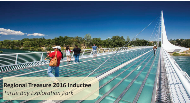
Regional Treasure 2016 Inductee Turtle Bay Exploration Park