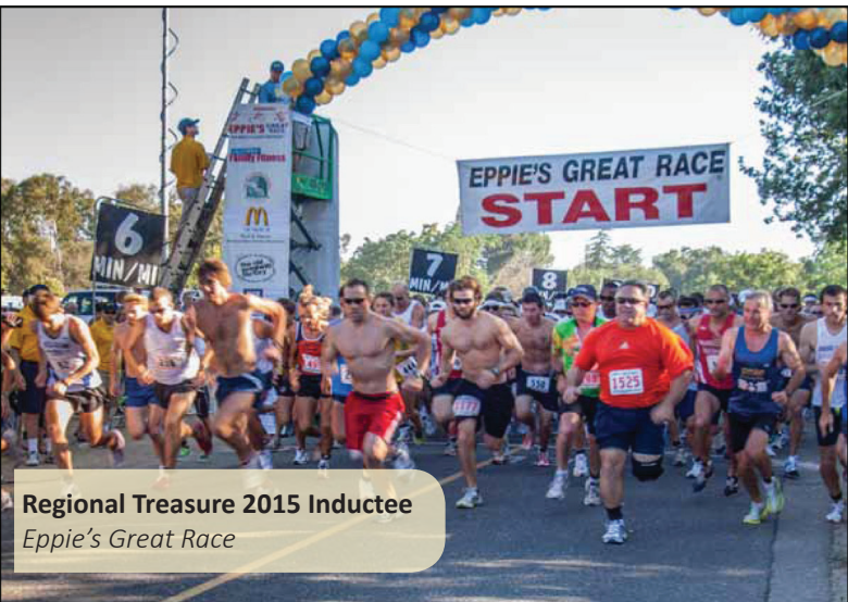
Regional Treasure 2015 Inductee Eppie's Great Race